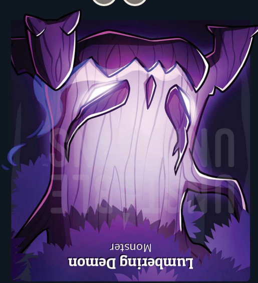
Lumbering Demon Monster

Each time you unsuccessfully roll to use a Hero card's effect, you may DRAW a card.