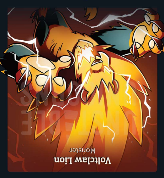
Voltclaw Lion Monster