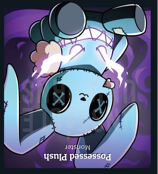
Possessed Plush Monster

REQUIREMENT: H + DISCARD a Challenge card