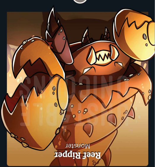
Keef Ripper Monster

Each time you play a Challenge card, DRAW a card.