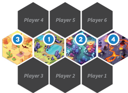
Home Hex tiles and their corresponding Characters:

Take all Hex tiles from the base game and expansion boxes, and place the Ancient Rune Hex tile 1 and the Mushroom Bog Hex tile 2 on the table to create the center of the Map. Place the Dusty Desert Hex tile 3 and the Underground Volcano Hex tile 4 on opposite sides of the center of the Map. To complete the Map setup, have each player place their Home Hex tile on the table as shown. The youngest player is considered Player 1, Player 2 is the the player on their left, and so on. If you are playing with fewer than 6 players, you may fill the rest of the Map with any remaining Hex tiles.