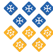
10 STATUS TOKENS