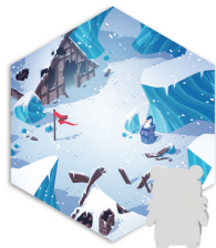
Frost Polarpaw + Frost the Merciless