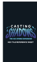
1 HEX TILE REFERENCE SHEET