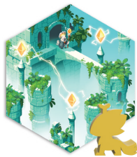
Talon Lightfeather + Talon the Dark Storm

After the Map is set up, place your Meeple on your Home Hex tile. Next, shuffle the Counterspell deck 5 (including all base game and expansion cards), then place it face down on the table next to the Dusty Desert Hex tile.